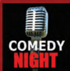
COMEDY NIGHTS 7/17, 8/28, 9/16