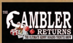
KENNY RODGERS TRIBUTE 11/25