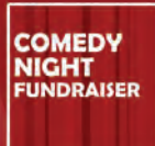
BENEFITS BHVFC 11/11