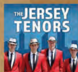
JERSEY TENORS 12/31