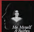
ME, MYSELF, AND BARBRA 8/14