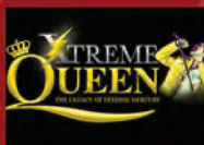
XTREME QUEEN 7/24