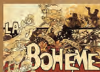
LA BOHEME 11/18