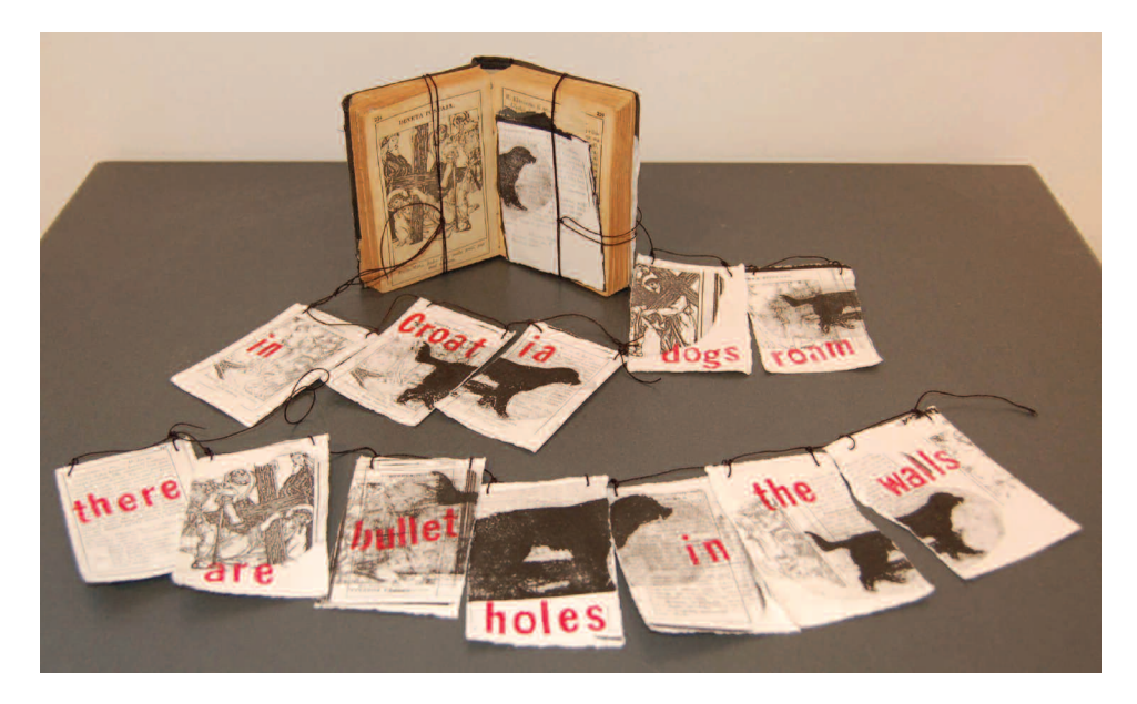
Croatian Prayer , 2013 Altered book 5 x 23 x 16 inches

I am very interested in making art with content. My work explores ways to communicate, question, and open a discussion with the viewer. Much of my work also includes text, sometimes simply to be read and give additional meaning to the work, other times as a comment on the image, and sometimes as a visual element that isn't completely readable. In 2005, my interests in image and text led me to book art, which is naturally an intimate and personal medium. I began with altered books, and then moved to making simple book structures using photography and printmaking. I have made books about different subjects including the legacy of slavery in the United States, dementia and aging, the personal narratives of overlooked individuals, multiculturalism in Europe, and Muslim identity in the United States.