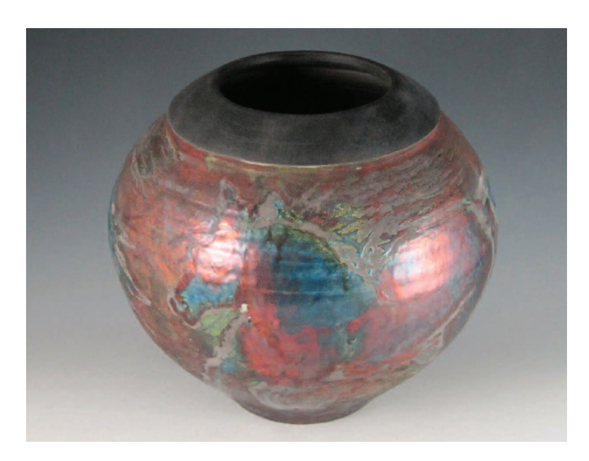
Blue Horse Running , 2011 Raku clay 7.5 x 6.5 inches